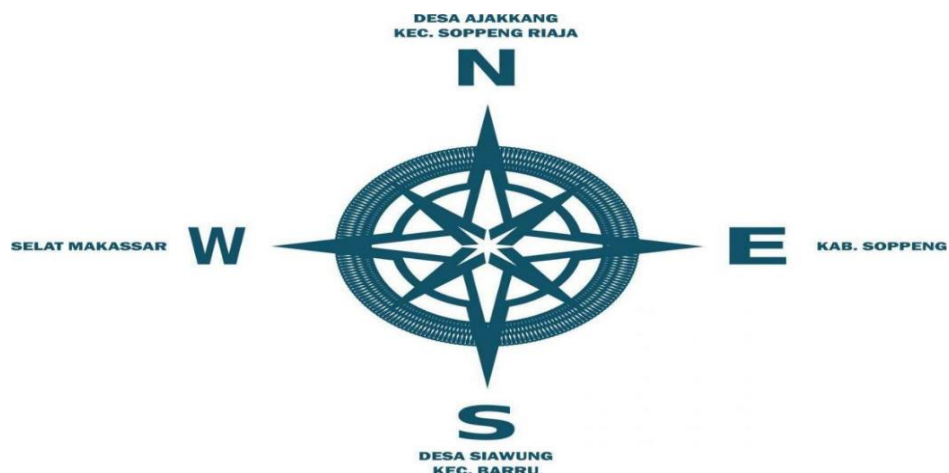
Figure 1. Balusu District area

Madello Community Health Center is a community health center in Balusu sub-district. Balusu district is one of the 79TUJU0 districts in Barru district. Geographically, Balusu sub-district is in the north of Barru Regency with an area of 11,220 km 2 with a population of 1842 people. Balusu sub-district is divided into 1 sub-district and 5 villages with regional boundaries which include: