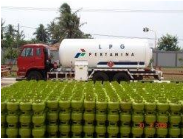
Figure 3. 3-kg LPG at LPG Bulk Filling and Transportation Station (SPPBE)