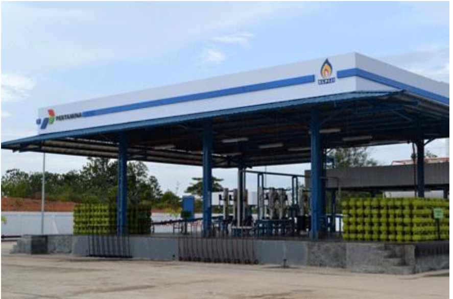
Figure 1 LPG Bulk Filling and Transportation Station (SPPBE)