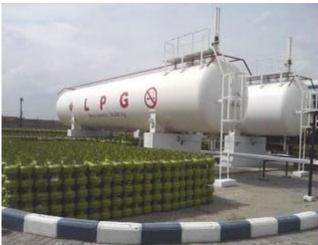
Figure 2 Storage Tank