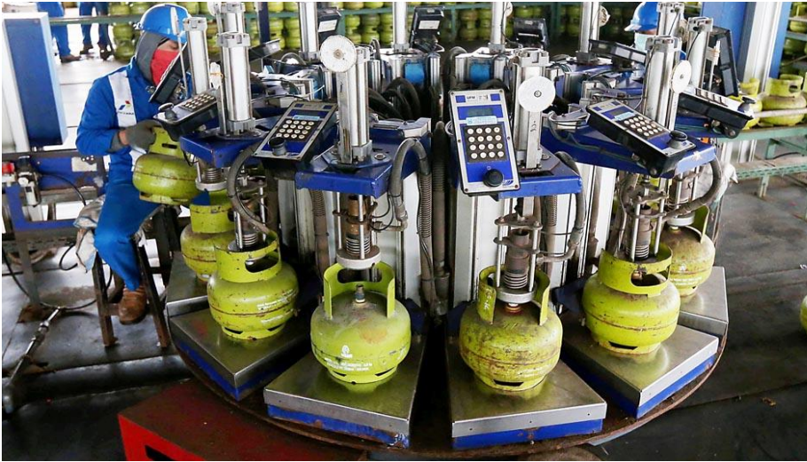
Figure 7 The LPG filling machine

Workers are filling 3-kg LPG cylinders in one of the LPG Bulk Filling and Transportation Stations (SPBE) in Indonesia