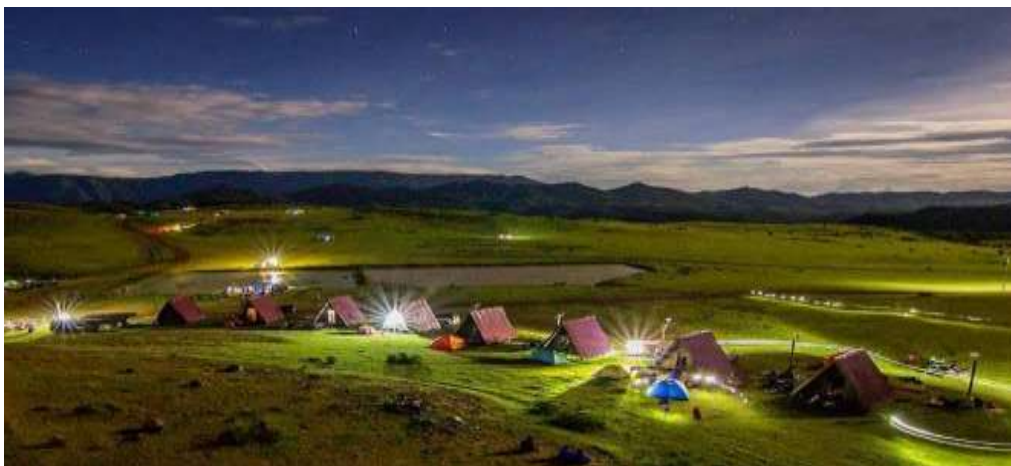
Figure 2: Nighttime Atmosphere at Lappa Laona