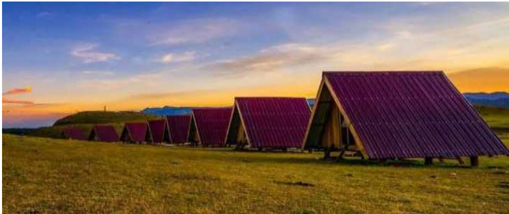
Figure 1: Villa House and Gazebo at Lappa Laona

The Green Highland Lappa Laona is a tourism destination that presents a savanna landscape in the highlands of Barru Regency. In addition to enjoying the grasslands, visitors can engage in various activities including a 270 meter long flying fox, camping ground, two selfie/photo spots, mountain bike park, and a number of iconic gazebos.